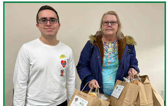
Thanks for making deliveries, Challah Helpers!